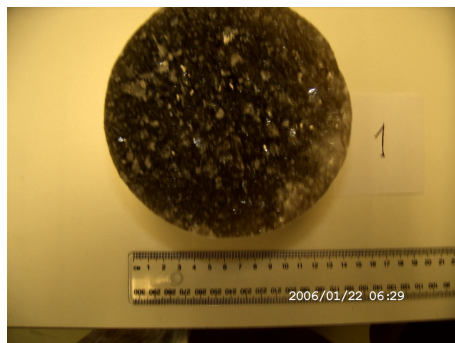
Figure 2. Drilling core sample from Slănic Prahova saltwork, Romania